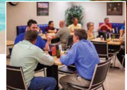
San Antonio, Texas