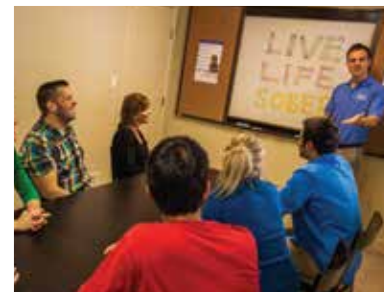
The Woodlands, Texas