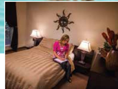
Dallas-Fort Worth, Texas